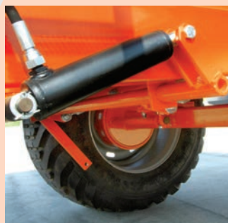
Braking system (2)