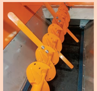
Kit for spreading dry chicken-manure

The MAXI fertilizer spreaders have been designed to respond to the requirements of professional operators and of third-party contractors for the distribution of fertilizers on large extensions of land. They are equipped with a tank having a high loading autonomy which guarantees a daily working performance of several hectares. The bearing frame, of solid construction, allows for speeds of up to 40 km/h.