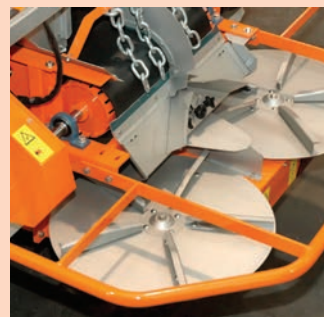
Wet lime spreading unit